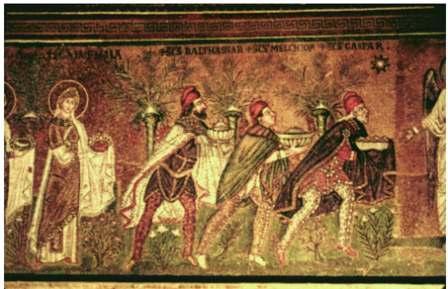
6th Century mosaic of Magi from Ravenna, Italy

But the best-laid royal plans fail because their accomplices (the Hebrew midwives, the magoi ) instead deceive their superiors in order to choose life. We never hear again of these mysterious heroes in the biblical story—yet upon their