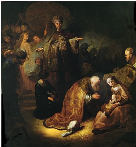
Rembrandt, "Adoration of the Magi"

But how are ancient, mythical magi supposed to protect us from such epidemic dehumanization? Their story is indeed the focus of Epiphany, alluded to at the end of the feast's Old Testament reading (Isa 60: 1-2, 6):